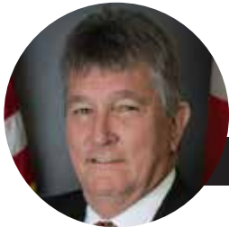
Commissioner Jim Peacock Jackson County