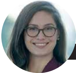
Commissioner Jack Porter City of Tallahassee